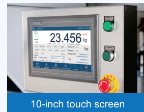
10-inch touch screen

User-friendly interface design, vivid display, easy to operate.